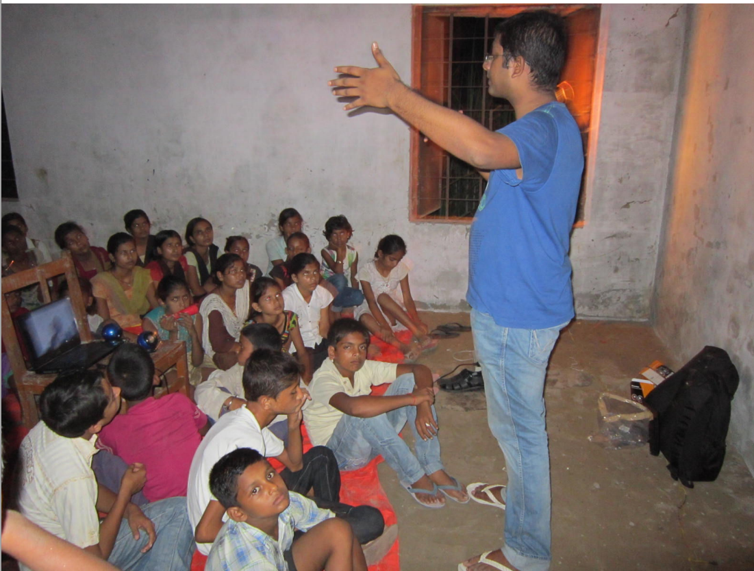
A night class in progress with more than 100 children from different villages

"We took around five students to Parivartan NGO for a 4-5 days exposure trip where kids learnt yoga, dancing, painting. This was a great confidence booster for the kids, and more students started getting connected with us," he says.