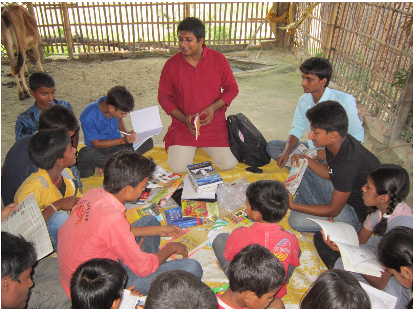
During the start of the initiative – June 15th, 2013