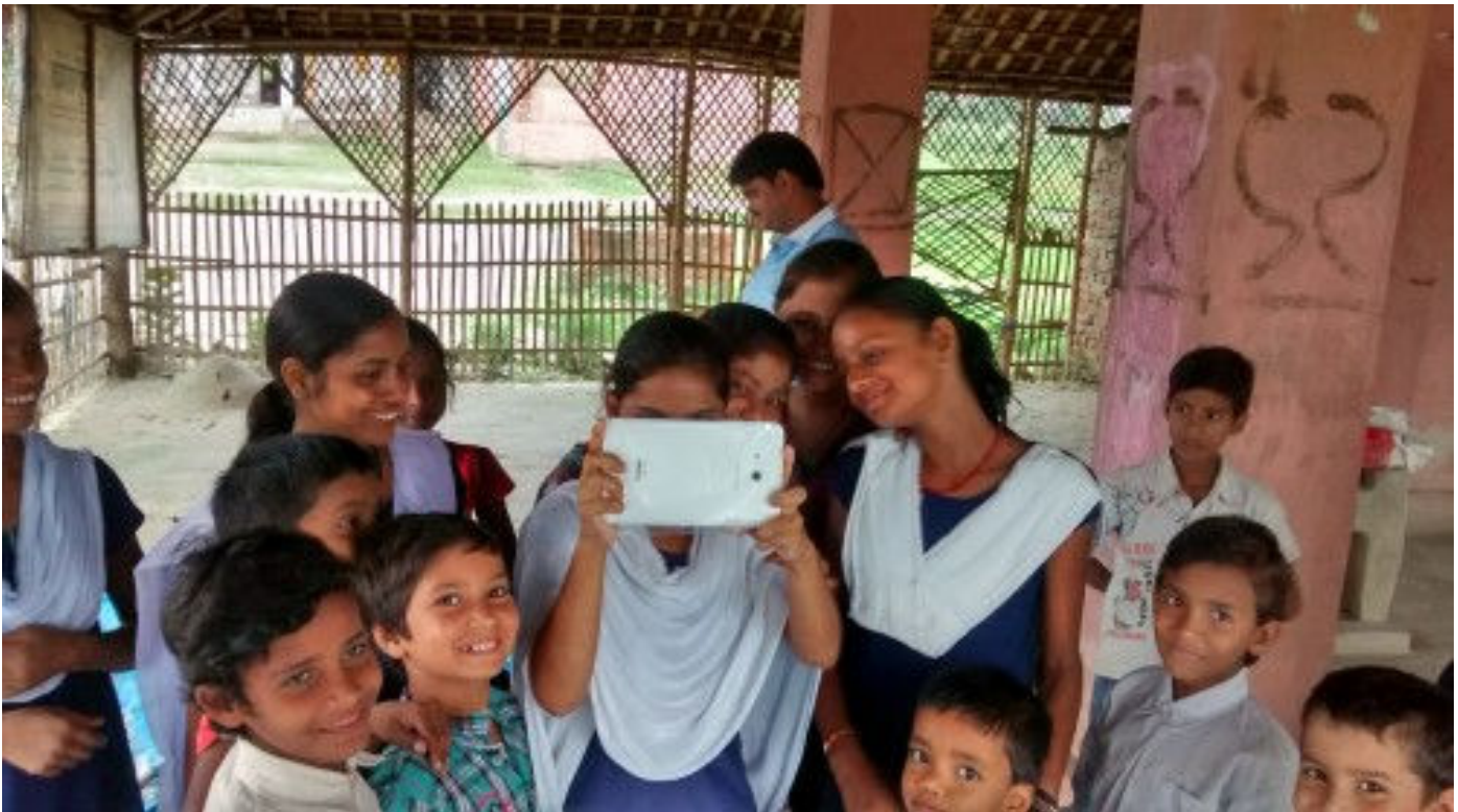
Girls exploring a tablet for the first time

This inspired PRAYOG to start a fundraising campaign on Milaap to raise funds for purchasing 200 solar lamps. A basic solar study lamp costs Rs.450 and the entire project would need Rs.90,000 to become operational. He has managed to raise around Rs.30,000 so far and is hoping to get more help to reach his goal. The campaign will close in 12 days.